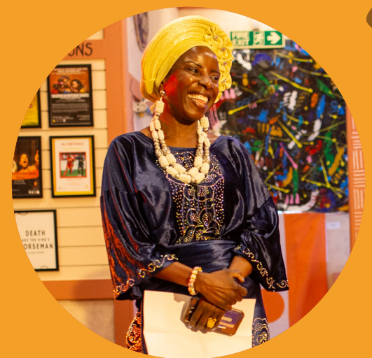
Creative and cultural events