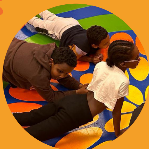
Youth Academy (Ages 9-19)