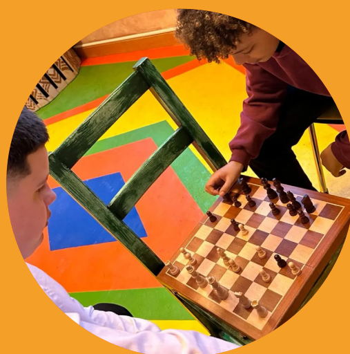
Learning Club (Ages 9-19)